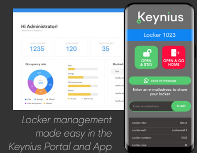
Locker management made easy in the Keynius Portal and App

Call or mail us at: 00353 14018801/info@lockerfix.ie