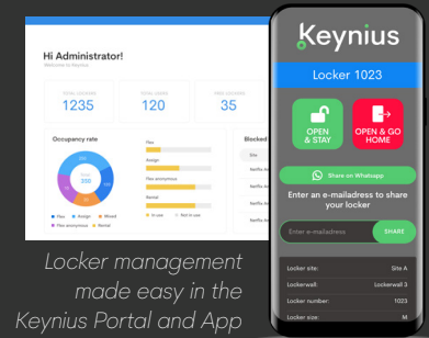
Locker management made easy in the Keynius Portal and App

Wondering if this could be for you? Of course we'd really love to hear from you. Call or mail us at: 00353 14018801/info@lockerfix.ie